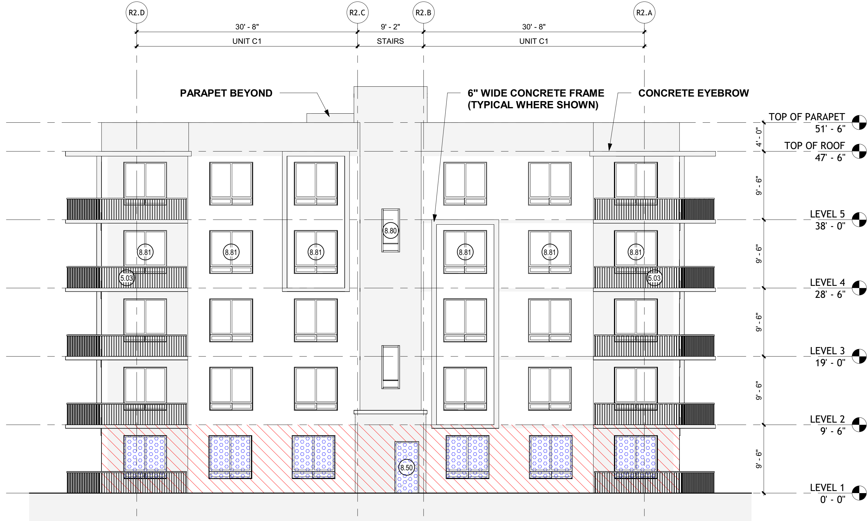
2 BUILDING #1 (WEST), #6 (EAST) FACADE 1/8" = 1'-0"

FENESTRATION/TRANSPARENCY CALCULATION: WALL AREA: 763 SF (100%) FENESTRATION: 239 SF (31%)