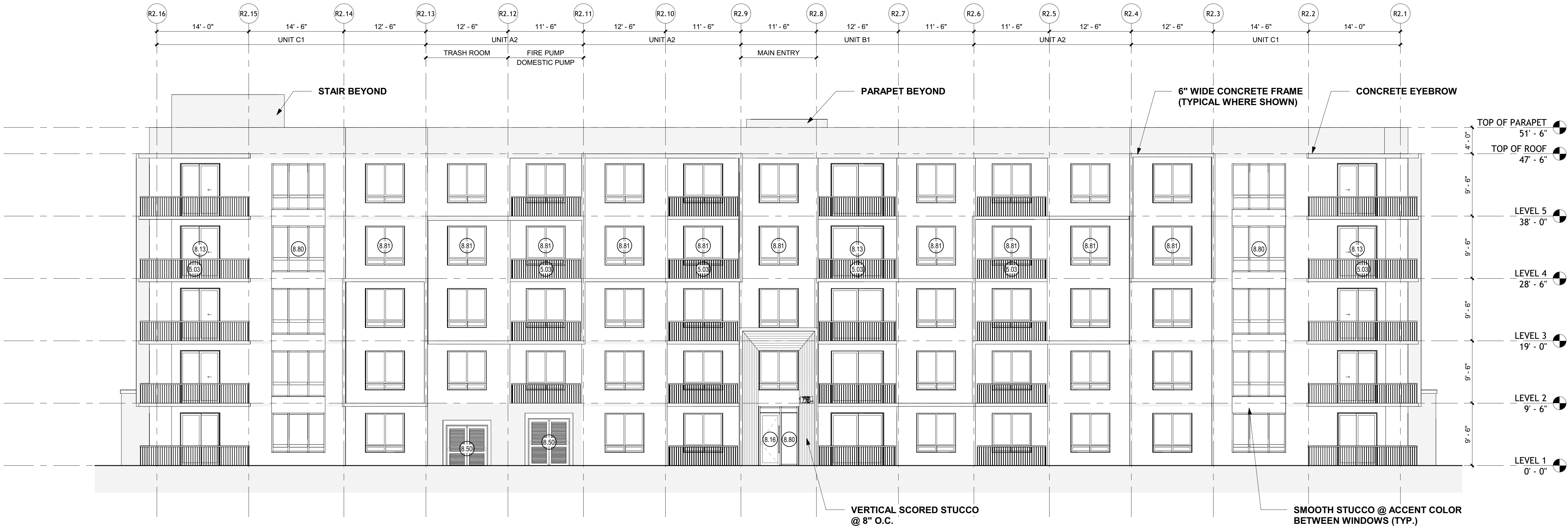
1 BUILDING #1 (SOUTH), #6 (NORTH) FACADE 1/8" = 1'-0"